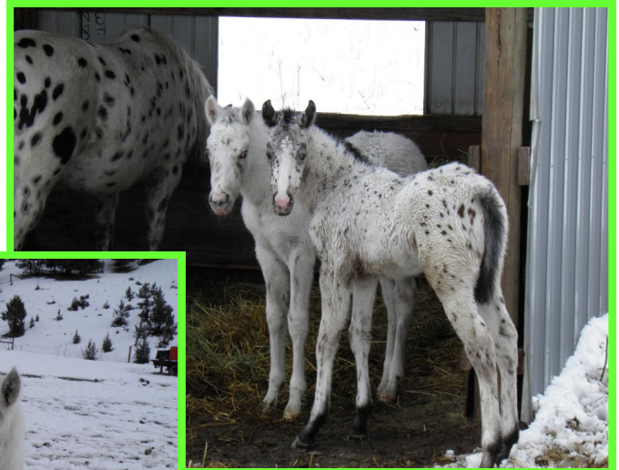
Top: Renegade (on Left) Alice (on Right).

Bottom: (foreground) Renegade, Alice, & WAR Starnight (Alice's dam).